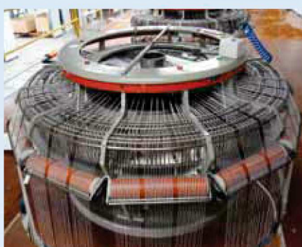
Weaving loom at factory