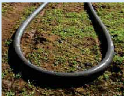
Tight bend radius